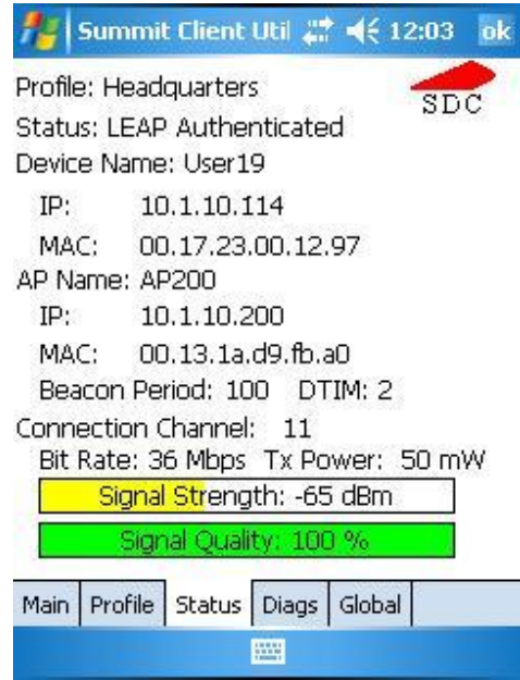
SCU is a graphical utility for configuration, troubleshooting, and management